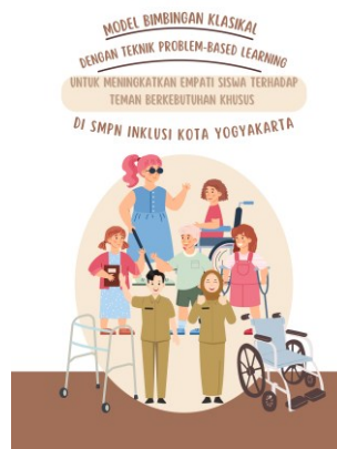
Figure 2. Learning Classical Guidance Model Display with Problem-Based Learning Technique

This stage aims to develop a research instrument for developing a classical guidance model with problem-based learning techniques to improve students' empathy towards friends with special needs. The instrument consists of expert validation (material and model feasibility), practicality test (guidance and counseling teacher assessment), and effectiveness test (empathy scale based on cognitive and affective aspects). This stage produces a draft of a classical guidance model with problem-based learning that aims to improve students' empathy. A model guide is prepared for guidance and counseling teachers as an implementation guide.