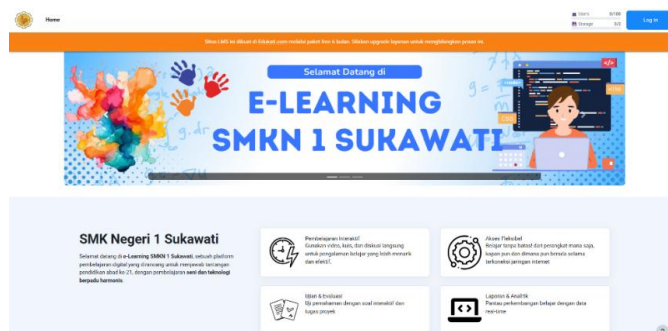
Figure 2. E-Learning Main Page Display

the LMS platform to support independent learning. The development stage implemented the designed plans into a tangible product using the Moodle LMS platform. The resulting product was a project-based e-learning prototype that included digital modules, tutorial videos, project worksheets, discussion forums, quizzes, and evaluation components. After the development process was completed, expert validation was conducted to assess the feasibility of the product. The overall evaluation results from the experts indicated that the developed learning media were considered valid and appropriate to be used as an interactive, engaging, and effective learning tool in supporting the improvement of students' learning outcomes, particularly in the Object-Oriented Programming subject. Examples of the developed project-based e-learning with a microlearning approach are presented in Figure 2.