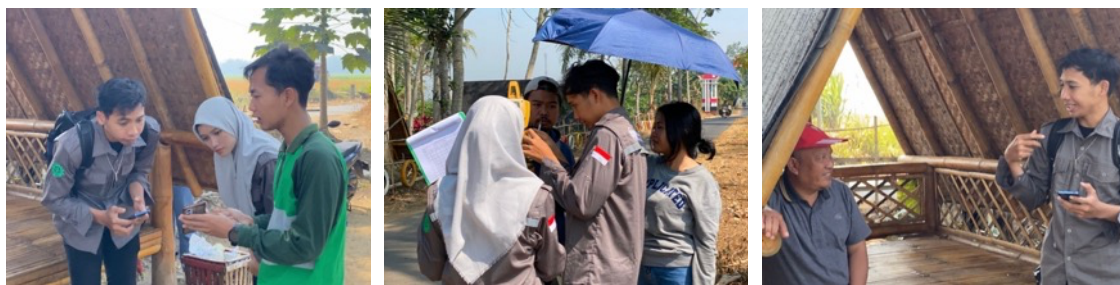
Figure 2. Focus Group Discussion (FGD) with the Village Community