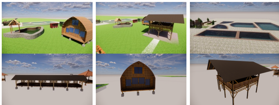
Figure 3. Sample Master Plan Results